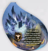
UTGARD REALM TOKEN