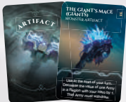
FROST GIANTS MONSTER ARTIFACT