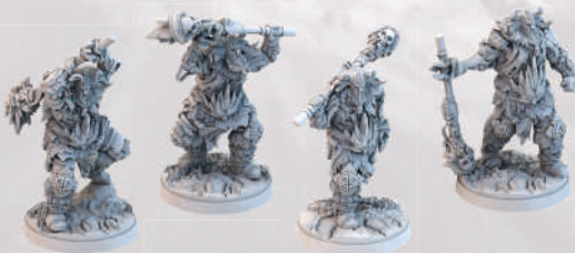
4 FROST GIANT MINIATURES