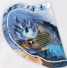
REALM FOR 2 PLAYERS