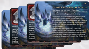
5 CONTROL CARDS