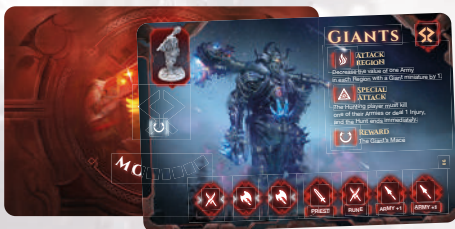
FROST GIANTS MONSTER TRAY