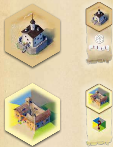
Example: When you place an inn in a size 4 area, it is increased to a size 5 area and will score 15 instead of 10 victory points when completed.

(Once your trade route is full, place any sold tiles on the sold goods tile storage space again.)