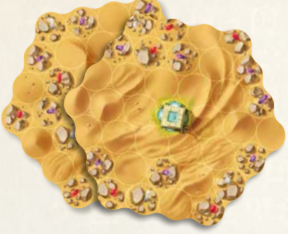
6 hexagonal Terrain Boards