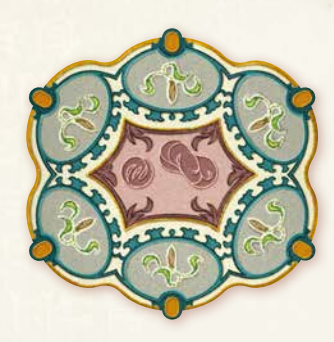
1 Carpet Board