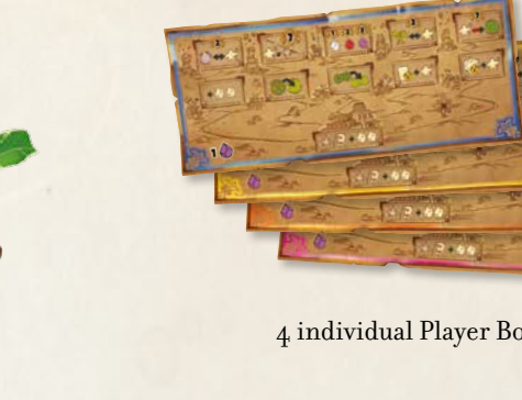
4. individual Player Boards